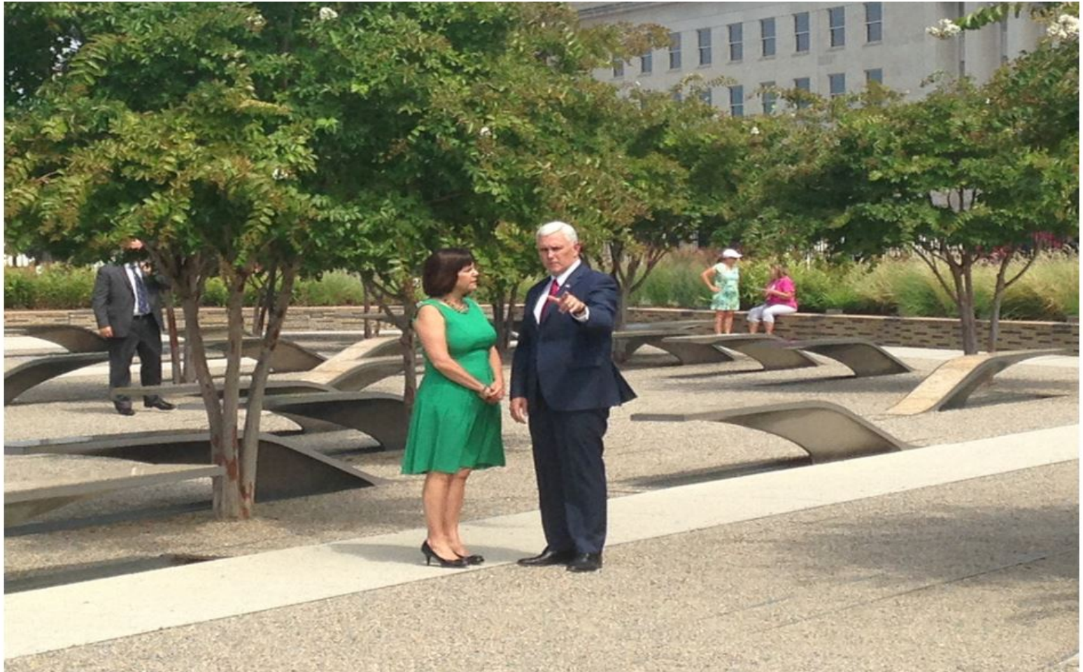
Indiana Gov. Mike Pence, the Republican vice presidential nominee, and his wife Karen made an unannounced visit to the September 11 Memorial at the Pentagon on Saturday.

Spends about a half-hour at memorial after speaking in Washington